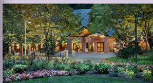
Princeton Marriott at Forrestal, Princeton, NJ